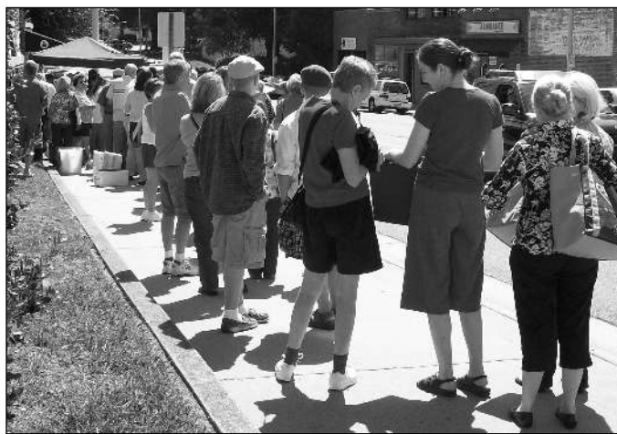
Eager Book Sale customers line up on the Davis Street sidewalk opening day.

When the sale ended many books remained, but non-profit groups such as Christmas Cheer, Alamance Citizens for Education, and Ralph Scott Life Services picked out usable volumes. Teachers and home schoolers showed up to take science and nature sets. Dealers purchased all that was left, and rather quickly, the shelves were empty and waiting. Donations for our March 19, 2010 sale are needed now!