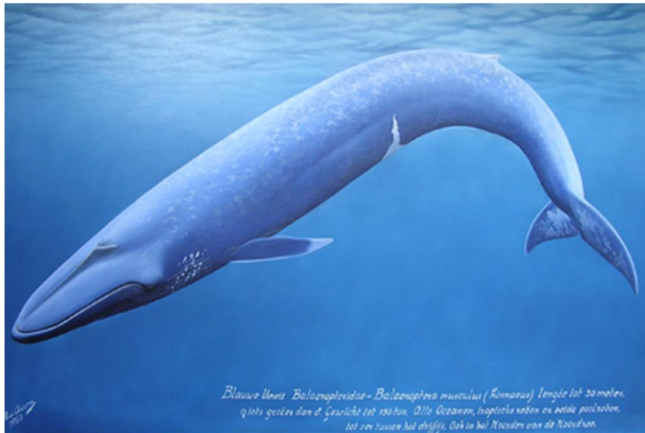
Blauwe Wals - Balaeopteridae - Balaeoptera musculus (Linnaeus) Lengte tot 30 meter. Gewicht groter dan d' Oorlicht tot 150 ton. Alle Oceanen, voornamelijk nabij en aan de poolstreken. Tot een tussen hal drijfje. Ook in het Noorden van de Noordzee.

↓ This much of a good time will be had by all!